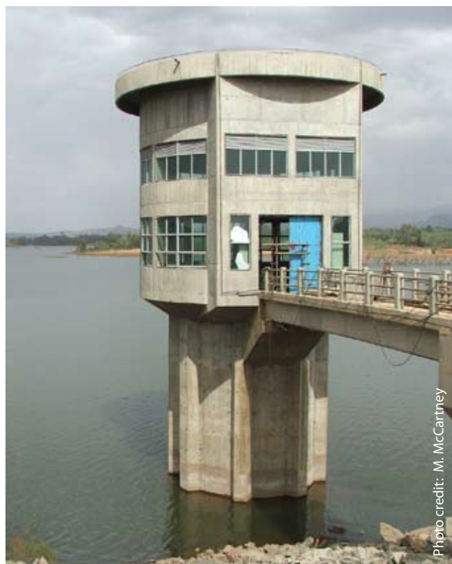
Intake tower on the Koga Reservoir, Ethiopia.

Of all the choices available for water storage, large dams are the most controversial. Many large dams contribute significantly to economic development. However, it is also true that inappropriate construction and operation have been the cause of significant social and environmental costs and have adversely affected poor people. For most of the world's large dams, downstream economic and environmental consequences have been given little attention in design and operation. Most dams were constructed with the emphasis on maximizing the economic returns from the dam itself, with little understanding of the long-term consequences of changing river flow patterns downstream.