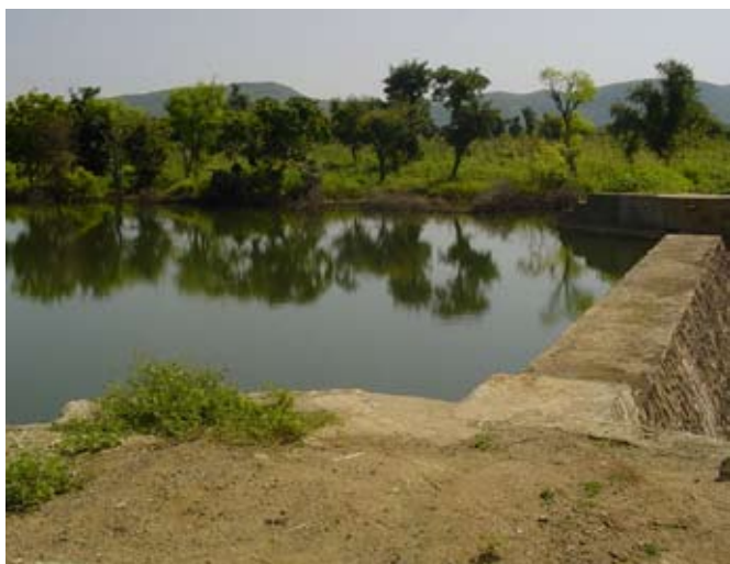
A small reservoir in Africa.

Over the last 40 years, there has been an increasing understanding of how dams modify riparian ecosystems. Using dams to regulate flow has been found to cause serious degradation of ecosystems and the natural resources and services upon which many people living downstream of the dam depend. Concerns about the negative social and environmental impacts led to reduced investment in large dams in the 1990s. More recently, there has been a reevaluation of the role of dams and though the controversy continues, investment in large dams in Africa and Asia is increasing again.